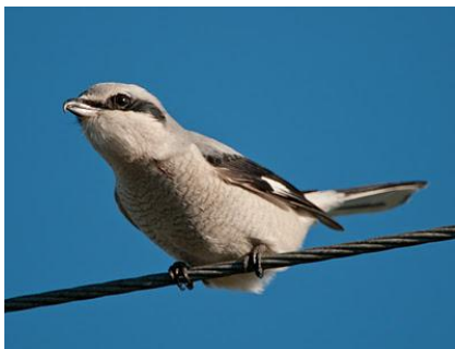
Northern Shrike Winter Birds Have Arrived!