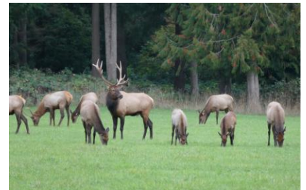
Elk of the North Cascades

Tuesday, January 10, 2017 7:00 Social; 7:30 Progra Padilla Bay Interpretive Center 10441 Bayview-Edison Road Mt. Vernon, Washington