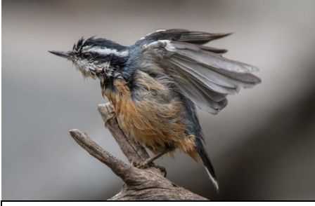
Red-breasted Nuthatch after a bath.