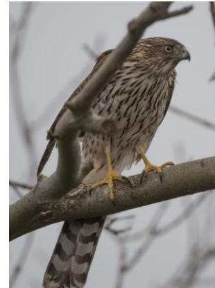
Cooper's Hawk