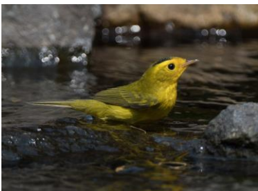
Wilson's Warbler