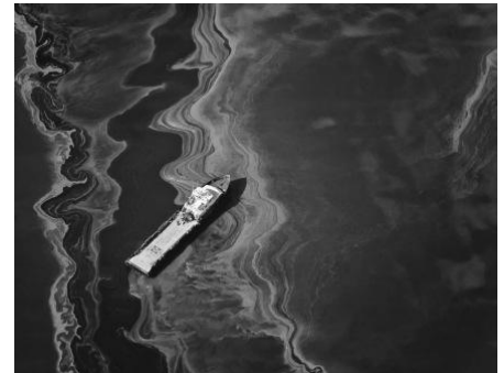
DEEP SEA OIL DISASTER

Tuesday, February 14, 2017 7:00 Social; 7:30 Program Padilla Bay Interpretive Center 10441 Bayview-Edison Road Mt. Vernon, Washington