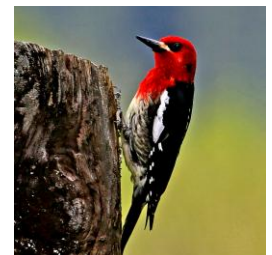
Red-breasted Sapsucker

Red-breasted Sapsucker 2 in Anacortes yard on 9-28 (JB)