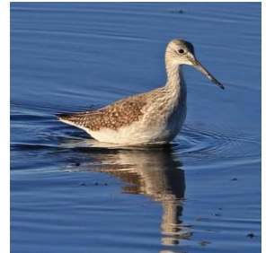
Greater Yellowlegs

Greater Yellowlegs 109 at Jensen Access on 9-30 (RM)