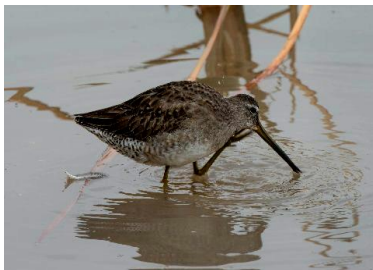
Wilson's Snipe 2 at North Burlington Industrial Park wetland on 2-2 (RH)

Spotted Sandpiper 1 in Anacortes on 1-3 (GB); 1 at Coronet Bay, Deception Pass State Park on 2-20 (SAS) Long-billed Curlew 1 at March Point on 1-1 (GB) Marbled Godwit 1 at Tosi Point on 1-2 (GB) Long-billed Dowitcher 5 along Swinomish Channel on 1-2 (GB)