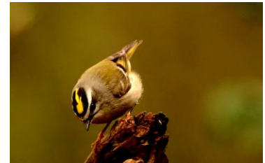
Golden-crowned Kinglet

Golden-crowned Kinglet several small flocks on ground on Interurban Trail near Larrabee State Park on 1-6 (LE)