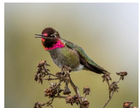
Anna's Hummingbird 63 counted in the CBC