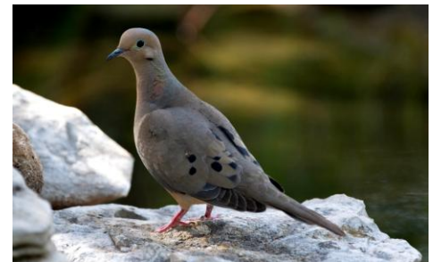
Mourning Dove 167 counted in the CBC