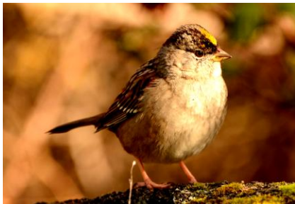
Golden-crowned Sparrow 852 counted in CBC