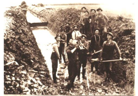
Digging Drainage Ditch No.18 Near Edison, WA ~ Fall of 1910

Tuesday, April 14, 2015 7:00 Social; 7:30 Program Padilla Bay Interpretive Ctr. 10441 Bayview-Edison Road Mt. Vernon, Washington