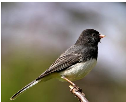
Dark-eyed Junco Slate-colored Race