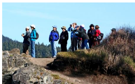
Field Trip 3/7/15: Deception Pass West Beach

Please Contact Leader: Libby Mills at 360-708-6975 or libbymills@gmail.com