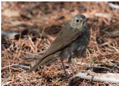
Juvenile Hermit Thrush by Joe Halton