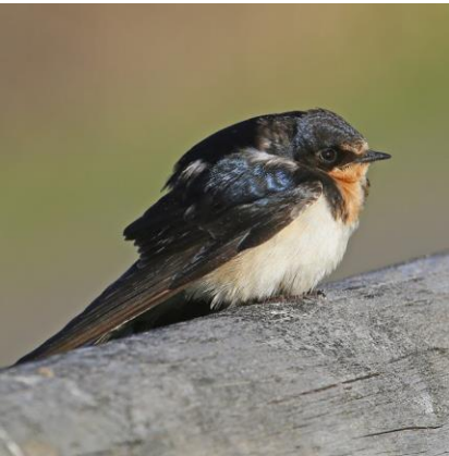
Barn Swallow