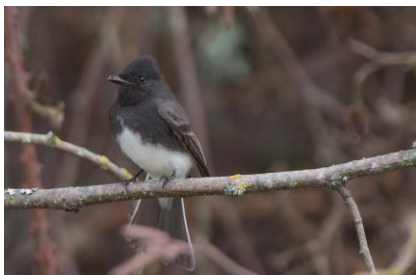
Black Phoebe, by Joe Halton