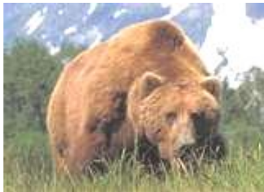
Grizzly Bear