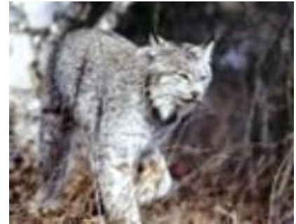
Canada Lynx

Tuesday, April 12, 2011 7:00 Social; 7:30 Program Padilla Bay Interpretive Center 10433 Bayview-Edison Road Mount Vernon, Washington