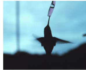
Hummingbird Feeding

Anna's Hummingbird 1 at Ship Harbor on 2/13 (GB)