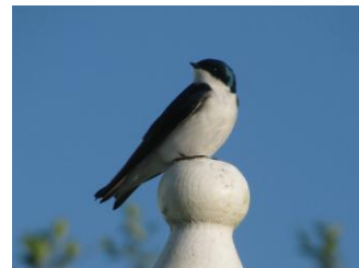
Tree Swallow

Tree Swallow several at Port Susan Bay on 2-5 (SAS); several at Wylie Slough on 2-15 (JB, MB)